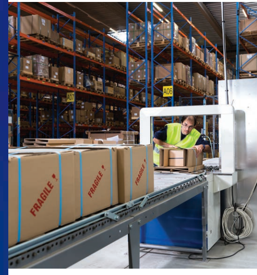
Packaging and shipment