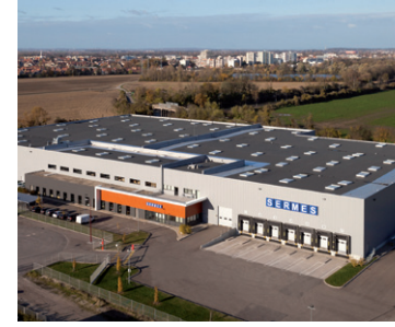
Motor drives, logistics centre